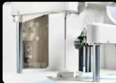
Independent mixing bar