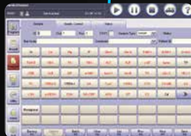
Intelligent software with user-friendly interface