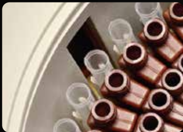
Built-in barcode reader