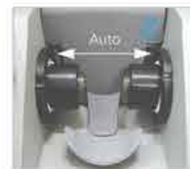
Auto-moving table with waterless probes