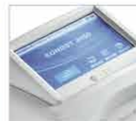
Touch screen color monitor